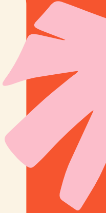
PHOTO SCAVENGER HUNT

Get your phone, polaroid or film camera & have fun taking photos!